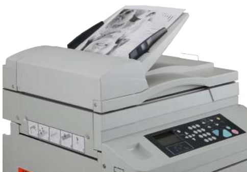
Automatic Document Feeder