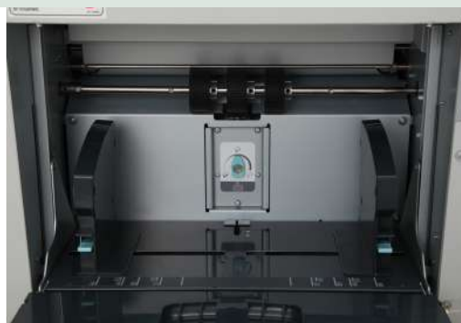
New Stepper Motor Paper Feed System