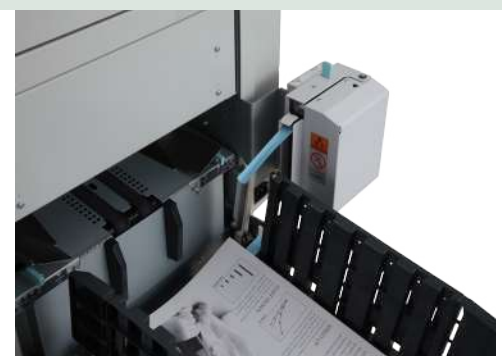
Optional Tape Cluster