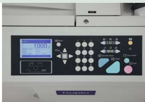
3.2 Inch LCD Control Panel