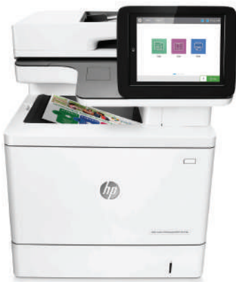
HP Color LaserJet Managed MFP E57540dn

Ideal for enterprises and medium businesses that need a secure, highly productive, energy-efficient color MFP.