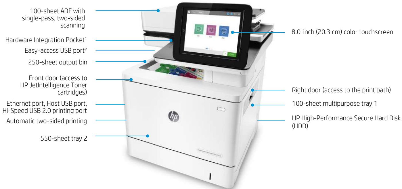
HP Color LaserJet Managed Flow MFP E57540dn