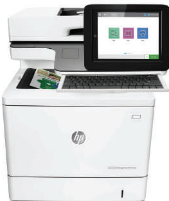
HP Color LaserJet Managed Flow MFP E57540c