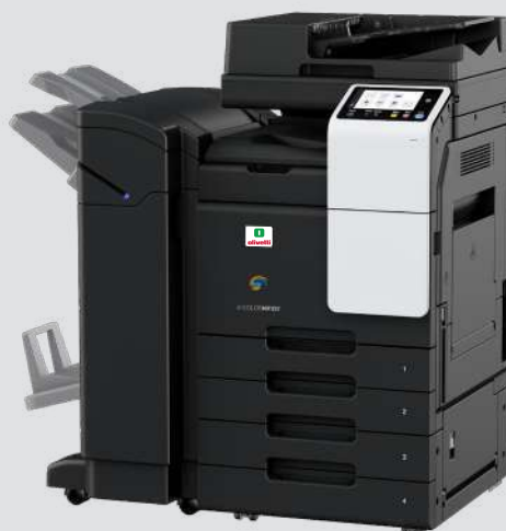
With FS-539SD and PC-218