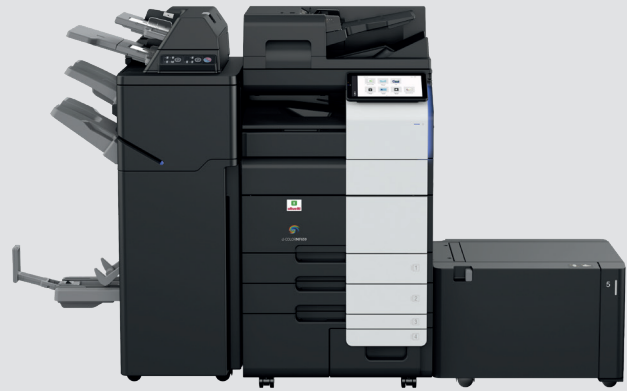
Configuration with Finisher FS-540SD, with Post-inserter PI-507 and connection unit RU-513, Side Drawer LU-207