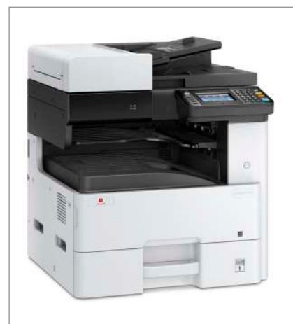
d-Copia 255MF in standard configuration