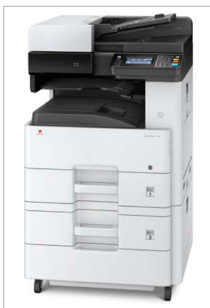
d-Copia 255MF with optional PF-470 drawer