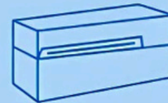
shipping label printer