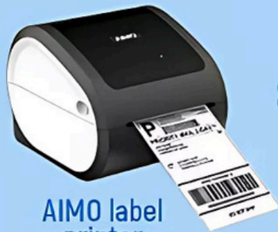
AIMO label printer