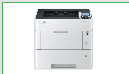
Compact and sleek