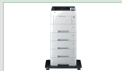
Configured with 4 x PF3110 Paper Trays and Caster Kit